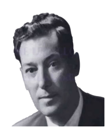
by NEVILLE GODDARD