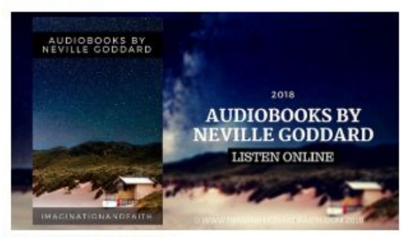
OVER 300 TEXT LECTURES